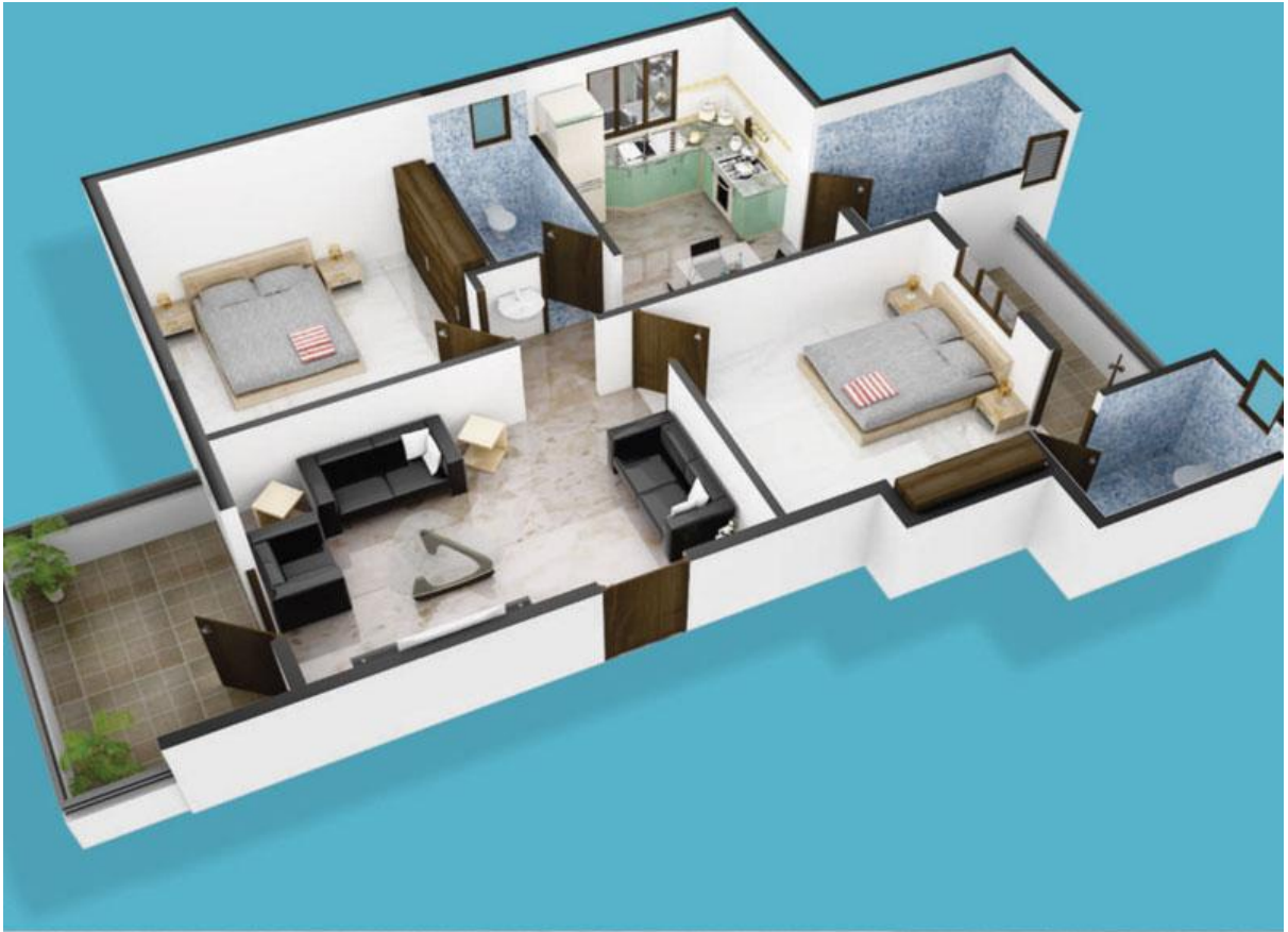
VIEW FOR FLAT